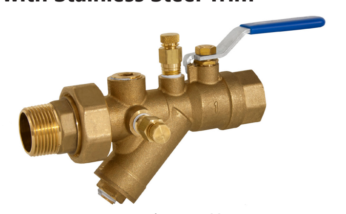
Terminator A SS