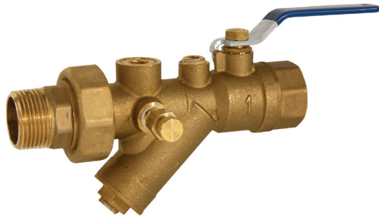
Terminator Y SS

Y-Strainer • Isolation Ball Valve • Union • 600 WOG • with Stainless Steel Trim